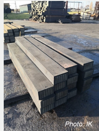
Fig. 1. Material of wooden track superstructure after impregnation in one of the sleeper treatment plants

The Railway Research Institute has also been conducting research and development work for many external entities for many years, where one of the most important task is the development of technical conditions for the performance and acceptance of sleepers, switch bearers and wooden bridge girders for PKP PLK. These requirements contain comprehensive requirements for the proceedings in the process of carrying out tenders for wooden track superstructure elements. Another example of the important work performed by the Institute is a comparative analysis of the chemical properties of creosote B and C oils, taking into account their impact on health and the environment.